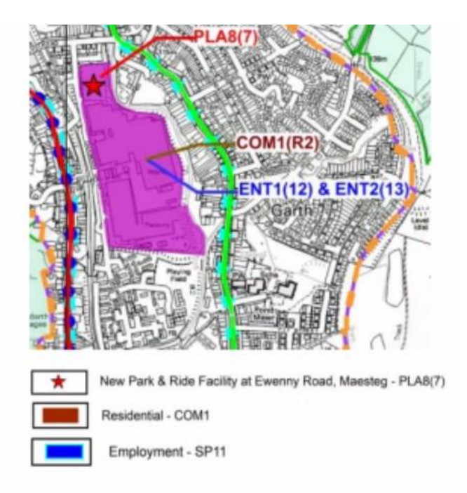
Fig. 8 – Extract from Replacement LDP Proposals Map