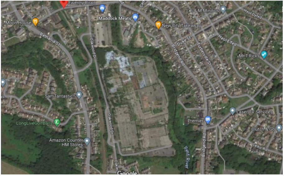
Fig. 5 – Aerial View of Site

Given the significance of redeveloping this brownfield/previously developed site, a development strategy has been progressed. Robust technical studies have been prepared that consider the level of flood risk at the site, the consequences of flooding and mitigation measures to address those risks and consequences. The phasing of the development has been considered with regard to the site enabling and flood works which will be required to be undertaken as part of the CCR funding process.