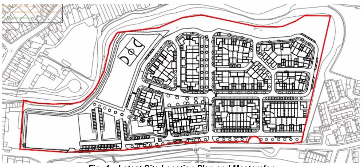
Fig. 4 – Latest Site Location Plan and Masterplan

The revised scheme relates to a proposed mixed use development comprising: residential; employment/enterprise hub, retail, public open space, access, engineering operations, and associated works. The application site is 7.65 Ha in area and is a joint venture between the Council and the main landowner.