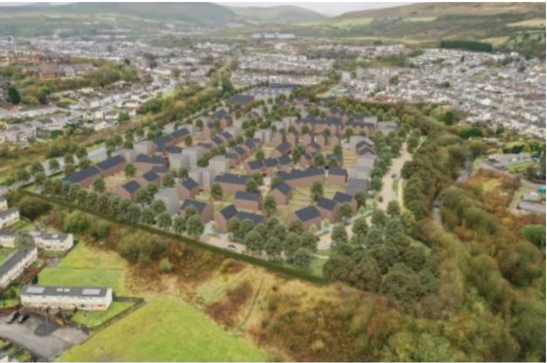
Fig. 10 – Illustrative view of the site from the South

Any future reserved matters application could more carefully address this matter and the Design and Access Statement submitted in support of this current proposal acknowledges that the proposed homes can be located at an appropriate distance away from existing uses and residential properties, and can be orientated side-on to ensure windows of habitable rooms do not directly overlook existing properties. In addition, the established hedgerow that lines the southern boundary will be retained with opportunities to enhance this green buffer with new planting in areas that are less dense.