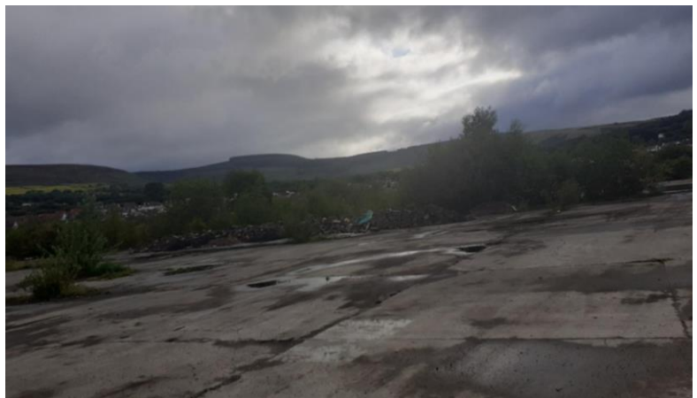
Fig. 7 – Photograph of Site