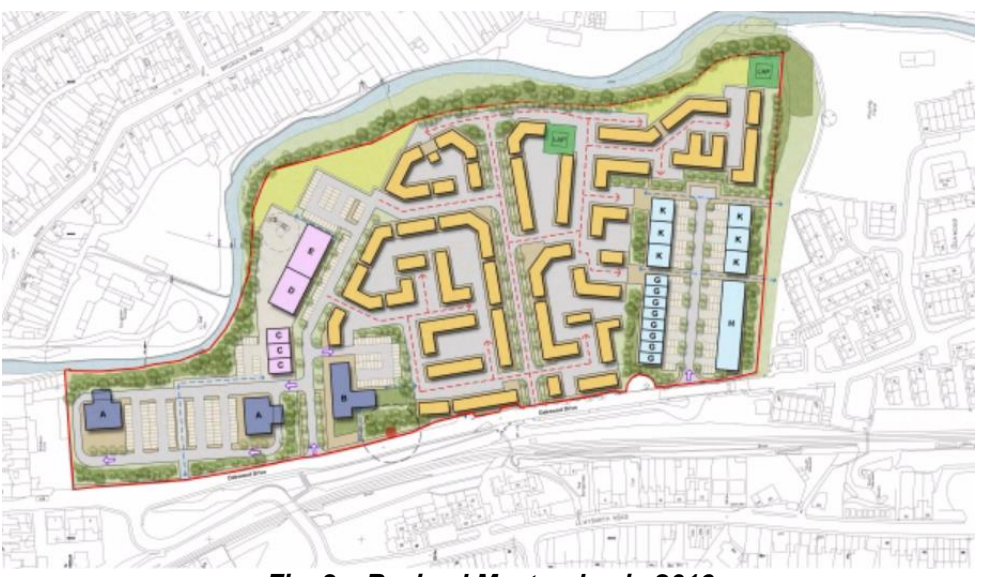
Fig. 3 – Revised Masterplan in 2016

At the subsequent Development Control Committee meeting on 9 June 2016, Members resolved to approve the application subject to the Applicant entering into a Section 106 Agreement to: