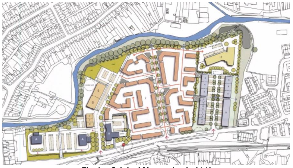
Fig. 2 – Original Masterplan in 2013

ix) up to 14 smaller B1 industrial units, providing no more than 2323 sq m of industrial floor space in total